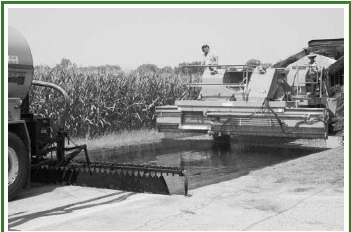
Wagner Paving crews work to apply chip seal to Pisgah Road near SR 571