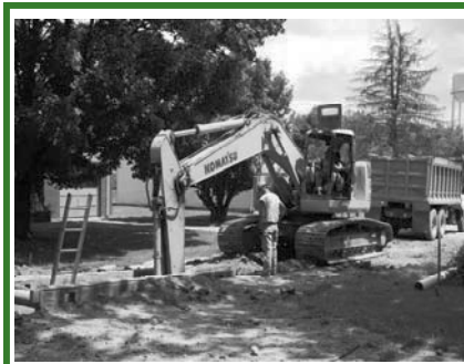
Field's Excavating works on Walnut Street in Brandt.

Phase II of the Brandt Sewer Project (gravity sewer lines in Brandt) has been in full swing throughout the summer. Progress has been steady and the contractor is on schedule with the project being approximately 70% complete. Paving of all township roadways in Brandt will be started in October and will be completed by November 15, 2011. The entire project will be completed by the end of this year. Sewer hook-ups for residents will begin shortly after that.