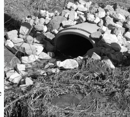
Culvert Repair under Wildcat Road