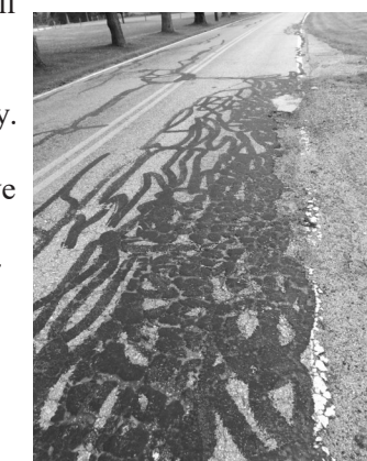
Crack Sealing can extend the life of a road. Many of our roads have extensive crack sealing on them.

Please give us a call if you see a pothole we have not fixed or have any questions about our roads.